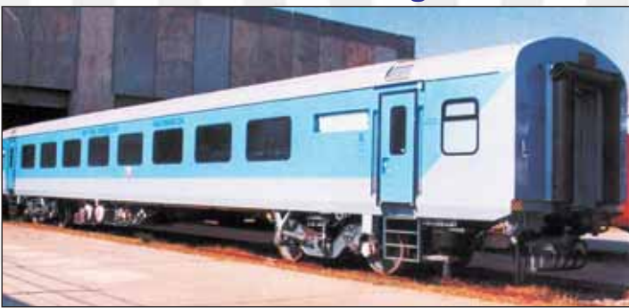
Delhi-Lucknow Shatabdi Express

At the present, the production units for Railways annually manufacture about 100 LHB coaches as part of a total capacity of