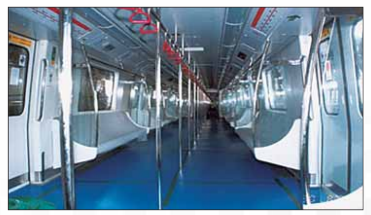
Interior of Delhi Metro Coach

Bharat Earth Movers Limited (BEML), a public sector unit of the defence department, has bagged a global tender for the manufacture and supply of 156 standard gauge stainless steel metro cars for the Delhi Metro Rail Corporation (DMRC). These cars are for the second phase of the metro. The coaches will be made at the Bangalore complex and will be delivered before the New Delhi Commonwealth Games of 2010. This would be the first time when standard gauge metro coaches would be manufactured in the country. Earlier orders of DMRC have been for broad gauge metro coaches