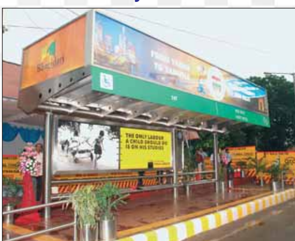
An image of DTC's new bus shelter

The Delhi Transport Corporation (DTC) is excited about its new source of income: its modern bus shelters that are expected to generate Rs 2.11 crore every month.