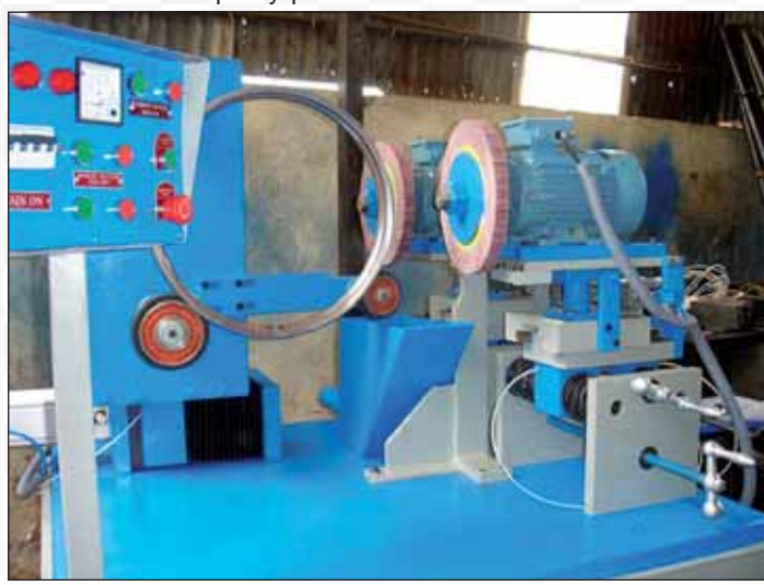
Special Purpose Machine

The manufacturing facility is state of the art technology with backward integration of critical processes such as cloth stabilization and bonding resin manufacture which ensures total control over vital quality parameters.