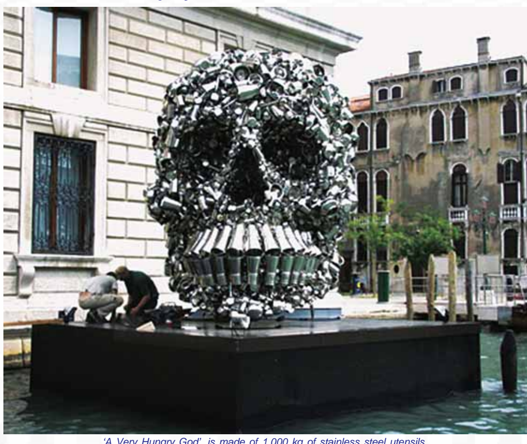
'A Very Hungry God', is made of 1,000 kg of stainless steel utensils

'A VERY HUNGRY GOD', a 1,000 kg stainless steel skull is on display at Palazzo Grassi, in Venice