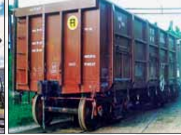
Australian stainless steel coal wagon