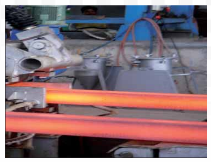
Twin stand continuous caster

Gopal Group has recently installed bright bar plant and is in the process of installing rolling mill also to take advantage of forward integration and synergies of operations among various group